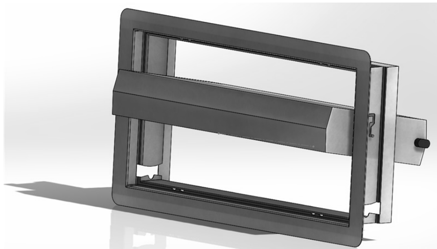
FIGURE 3—SMART VENT: SHOWN WITH FLOOD DOOR PIVOTED OPEN